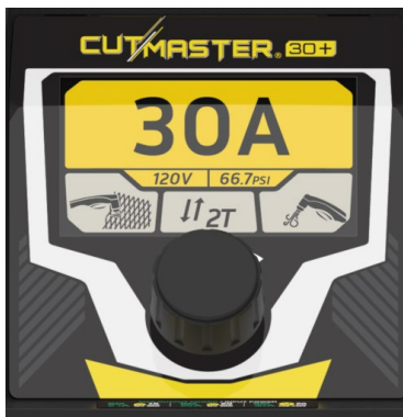
Simple and intuitive TFT LCD panel