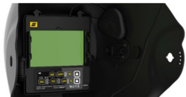
High optical class ADF, with colour touch screen interface