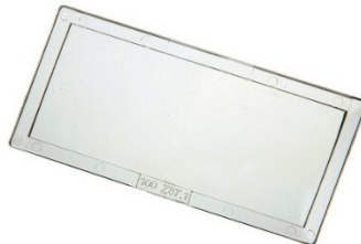
Magnifying Diopter Lens