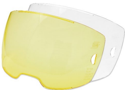
HD Front Cover Lens