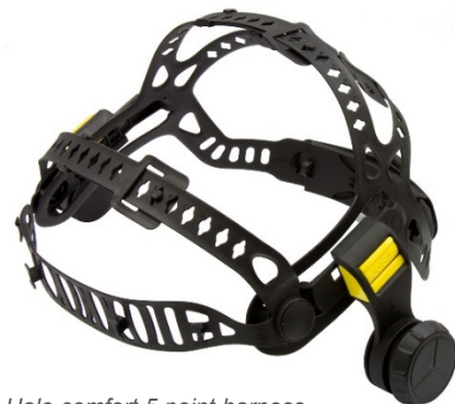
Halo comfort 5 point harness (Front view)