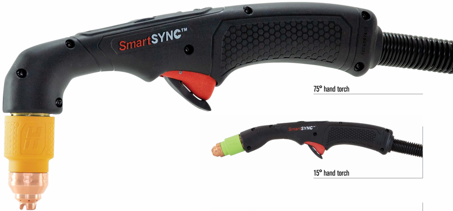
75° hand torch