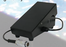
9826H Foot Switch