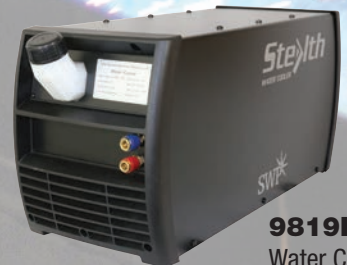
9819H Water Cooler