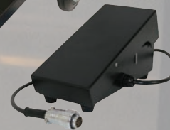
9826H Foot Switch